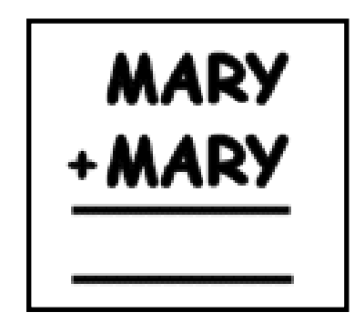
Last Weeks Rebus Solutions